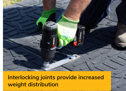
Interlocking joints provide increased weight distribution

It is the user's responsibility to assess the load-bearing capacity of the ground, and to only operate vehicles within the weight that the ground is capable of safely supporting. Please visit website for terms of guarantee.