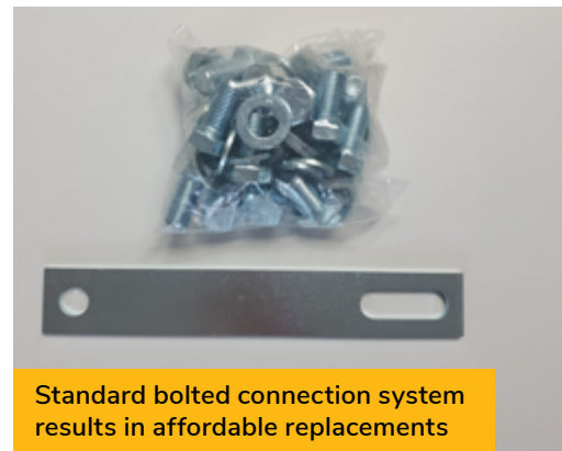
Standard bolted connection system results in affordable replacements