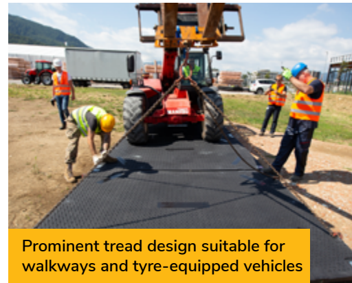
Prominent tread design suitable for walkways and tyre-equipped vehicles