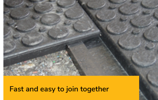
Fast and easy to join together