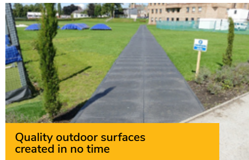
Quality outdoor surfaces created in no time