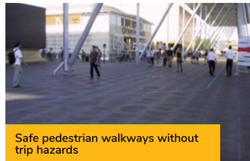
Safe pedestrian walkways without trip hazards