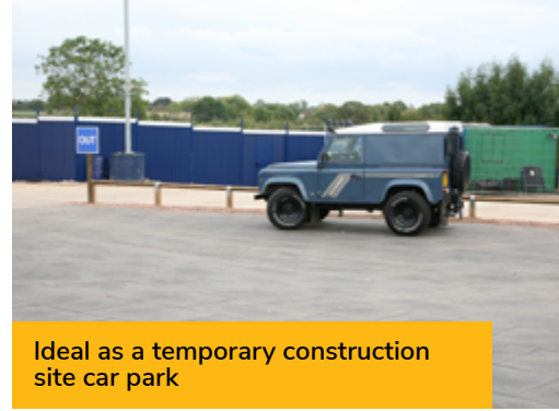
Ideal as a temporary construction site car park

This loading guide is for firm, dry ground. If the weather is likely to turn wet, or the job duration is in excess of a week, please ask for advice about using a more heavy-duty product.