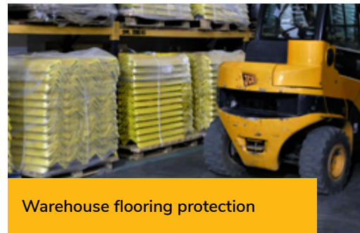
Warehouse flooring protection